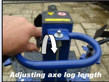
Adjusting axe log length

The starting height of the axe can be set by the operator to the exact length of the logs being split by a simple screw. The Eco 60/80/85 operate in exactly the same way but the Eco 80/85 also benefit from adjustable log grips.