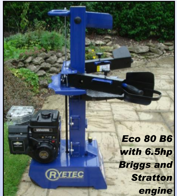
Eco 80 B6 with 6.5hp Briggs and Stratton engine

All models have two rear wheels for ease of movement, external on the Eco 60 & 85, internal on the Eco 80