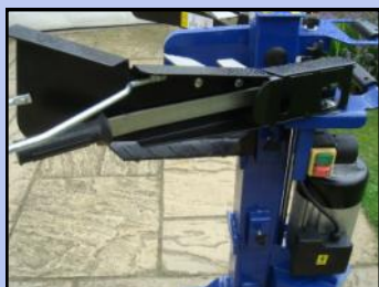
Robust lever controls on vertical splitters

The vertical build of the Eco 60 gives more control over the split logs which, instead of falling to the ground as with the horizontal design, can be left on the splitting table for further splits if required. The Eco 60 has a large electric motor which runs continuously with the splitting action controlled by two sturdy levers which also act as grips for the logs. Pushing down on both levers operates the axe which automatically returns to the start position when the levers are released. The height of the start position can be set by the operator to the exact length of the logs being split by a simple screw. A variable height table allows logs of up to 1 metre in length to be split. The Eco 60 also comes complete with a removable cross wedge and a 5 metre cable with 13 amp plug.