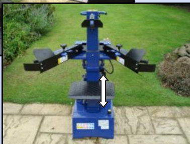
A variable height table allows logs of up to 1 metre in length to be split or 1.25 metres with the Eco85