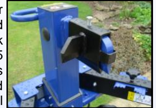
Cross wedge & quick included with Eco 80/85

The Eco 80 & 85 combine a larger and stronger frame than the Eco 60 with a powerful 7 ton splitting force making it ideal for harder and knottier wood. The extra power of the Eco 80/85 means it can split very hard seasoned wood and with the standard cross wedge logs to cut logs into four with one stroke. The cross wedge is easily and quickly removed for tackling harder and more awkward logs, or exchanged for the quick wedge & extension wedge (Eco 85 only) The Eco 80 B6 has a Briggs and Stratton Vanguard Commercial 6.5hp 4 stroke petrol engine and is ideal in remote locations.