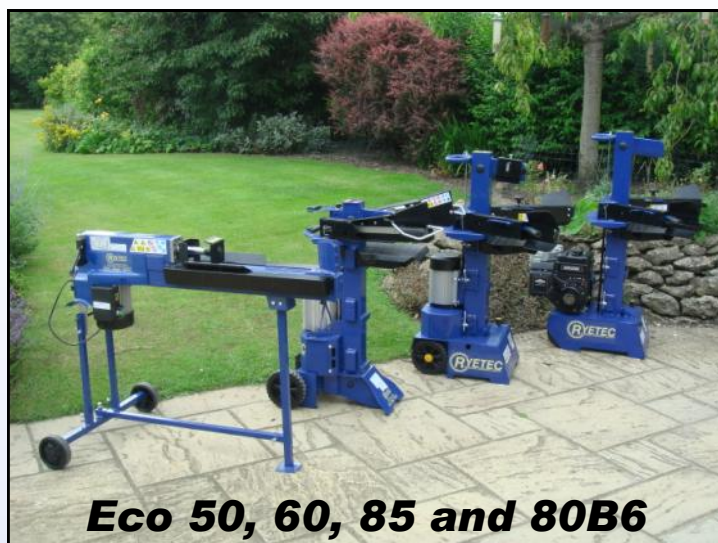
Eco 50, 60, 85 and 80B6