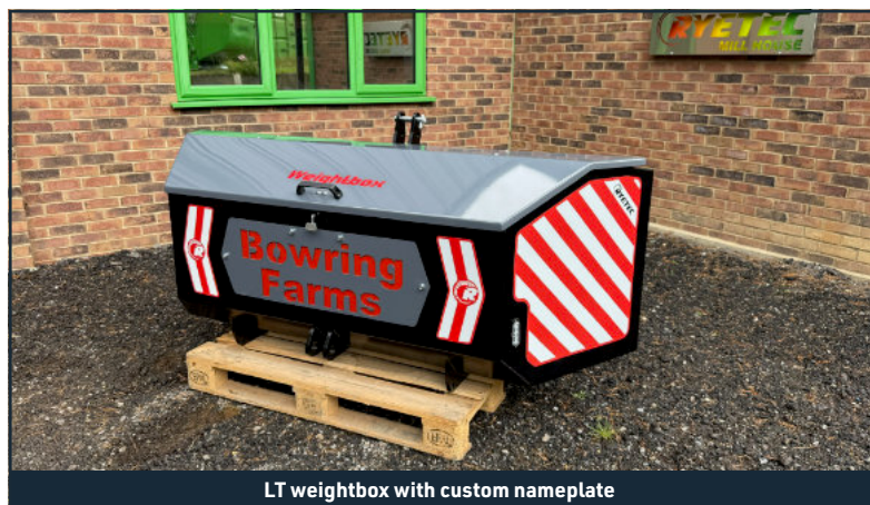
LT weightbox with custom nameplate