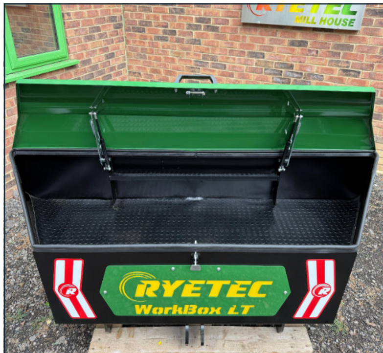
Large internal storage area with dust and water seal

For more information contact Ryetec Industrial Equipment Limited Mill House, A64 East Knapton, Malton, North Yorkshire YO17 8JA T: 01944 728 186 | www.ryetec.co.uk | f /ryetec