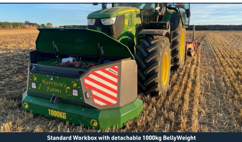
Standard Workbox with detachable 1000kg BellyWeight