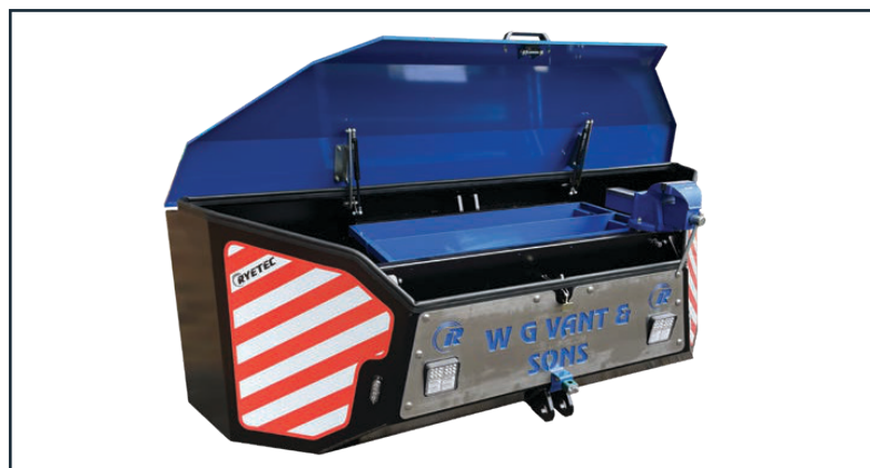
Standard Workbox with Removeable Trays, Stainless Steel Name Plate and Fixed Vice