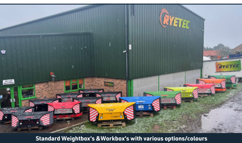
Standard Weightbox's & Workbox's with various options/colours