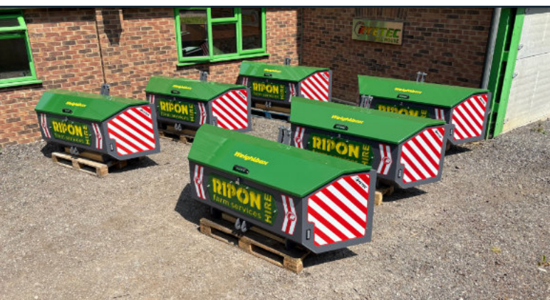
Collection of LT weightboxes