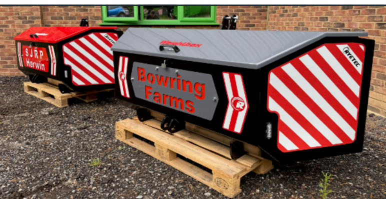
Choice of colour and nameplates