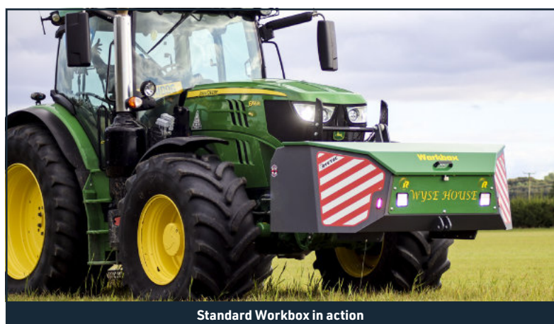
Standard Workbox in action

For more information contact Ryetec Industrial Equipment Limited Mill House, A64 East Knapton, Malton, North Yorkshire YO17 8JA T: 01944 728 186 | www.ryetec.co.uk | f /ryetec