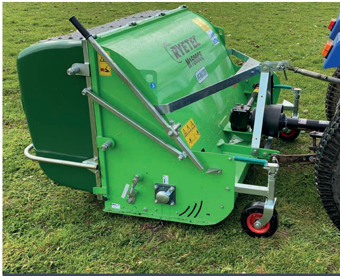
M1600CE with manual tip for tractors without hydraulics