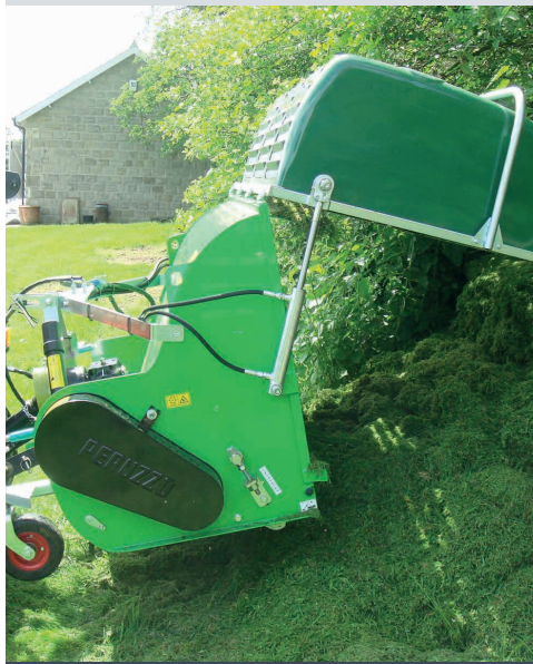
Hydraulic ground level tip on all 'C' models