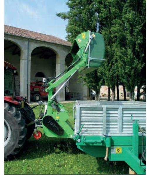
High tip (to 1.85m) on 1.2m and 1.6m models