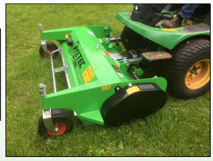
Optional Delta Flail gives finer finish