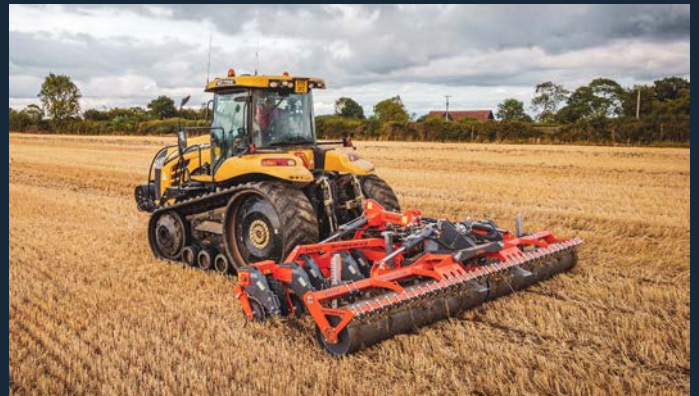
Restorer 6m ALD with rear packer