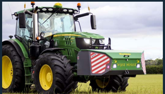
Workbox in action

For more information contact Ryetec Industrial Equipment Limited Mill House, A64 East Knappton, Malton, North Yorkshire YO17 8JA T: 01944 728 186 | www.ryetec.co.uk | f /ryetec