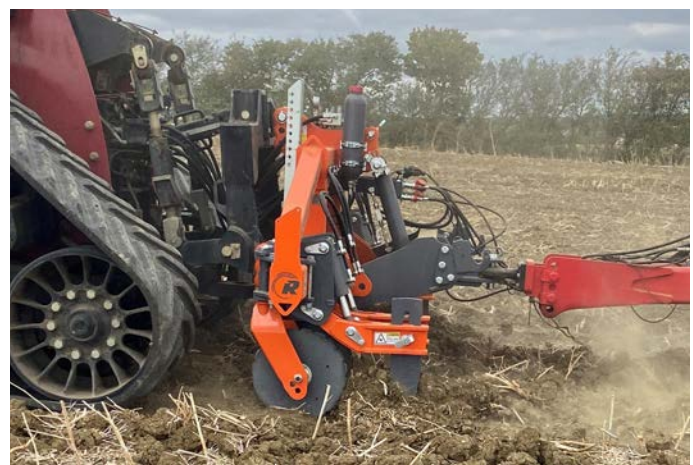
HD pivoting discs & legs

For more information contact Ryetec Industrial Equipment Limited Mill House, A64 East Knappton, Malton, North Yorkshire YO17 8JA T: 01944 728 186 | www.ryetec.co.uk | f /ryetec