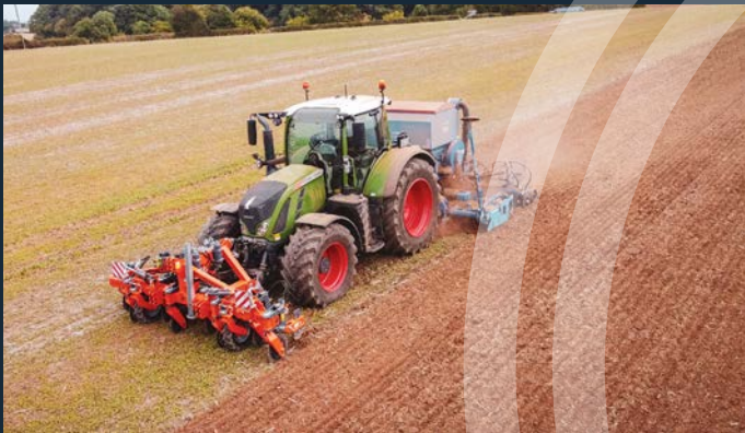
Restorer 4m ALD running front mounted with combi drill