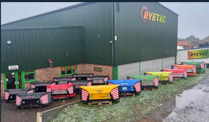
Weightbox's & Workbox's with various options/colours