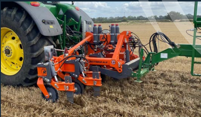
Restorer 4m ALD with hydraulic linkage working as a toolbar