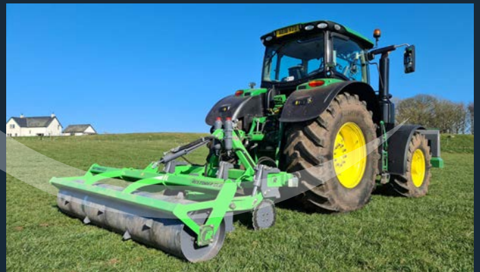
Restorer 3m GLD grassland low disturbance sub soiler