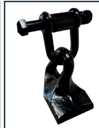
SL420 + SL320 Hammer Flail 08-23-90