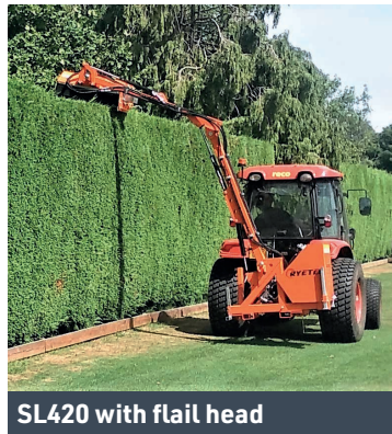
SL420 with flail head