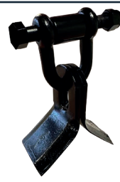
SL320 Y Flail 08-21-13