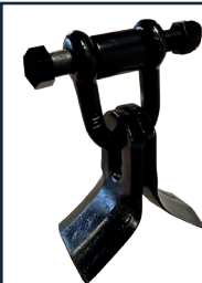
SL420 Y Flail 08-21-51