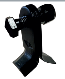
MP300 Y Flail 08-21-86