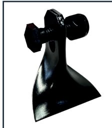
MP300 Paddle Flail 08-21-89